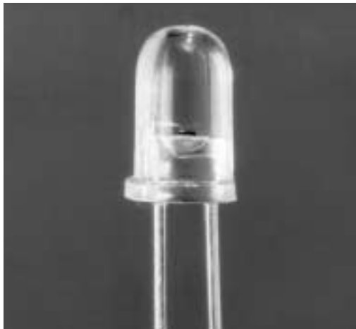
(Also available in infrared transmitting visible blocking version)